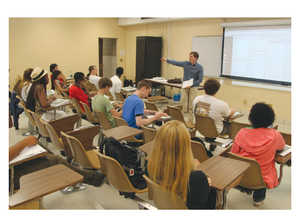
Alabama's Vocational Rehabilitation Service matches people to jobs.