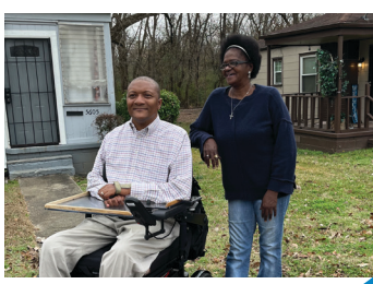
Working for People with Disabilities